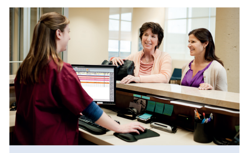
To learn more, contact your McKesson Value Added Reseller.

AutoRemind helps automate your patient reminder process, allowing you to communicate with your patients using their preferred communication method – text, email or voicemail. For more information, visit www.autoremind.us.